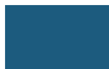
707 Marine Blue