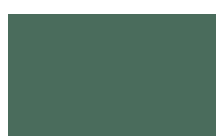
705 Green Mist