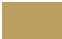
737 Forest Gold