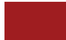
721 Relay Red