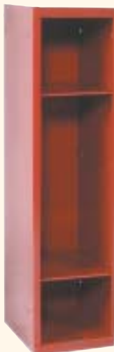
Primary II Cubbie