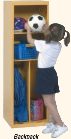
Backpack (1-wide unit)