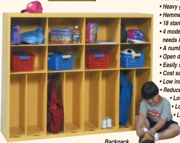
Backpack (4-wide unit)