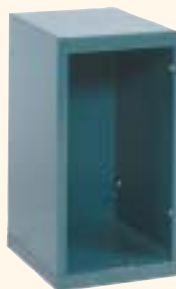
Primary Jr. Cubbie