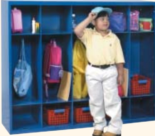
Primary II (5-wide unit)