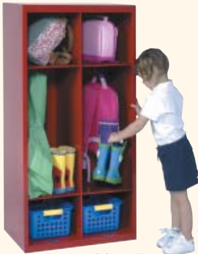
Primary II (2-wide unit)

Introducing Hallowell All-Welded Cubbies. We have engineered this new line of cubbies specifically for the elementary and early childhood school and daycare classrooms.