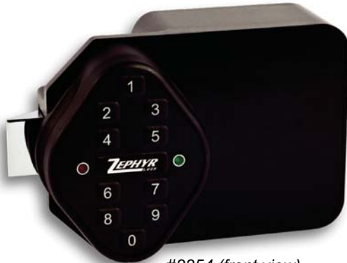
#2254 (front view)