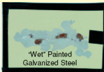
"Wet" Painted Galvanized Steel

Salt Spray Test: The photos above show the results of a 1000 hour salt spray test using Cold Rolled Steel with powder coat paint (left) and liquid paint over Electro-Galvanized steel (EG) at the right. Each sample was scored down to bare metal prior to the test. Note that the "creepage" from the score mark on the EG steel sample is considerably larger than the powder coat Cold Rolled Steel sample (actual sample size is 4" x 6").