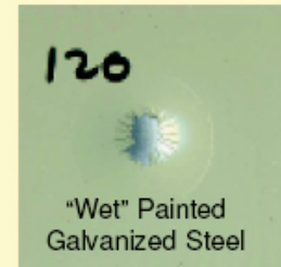
"Wet" Painted Galvanized Steel

Impact Test: The photos above show the effect of impact on Cold Rolled Steel with powder coat paint (left), and liquid paint over EG steel (right). This test shows how well the finish flexes and adheres to the steel with a standard 120 inch-pound force. Note that the liquid paint finish on EG steel has failed to adhere to the metal (shown actual size).