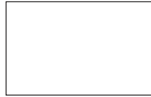
714 Snow White