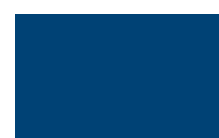
717 Grand Slam