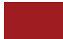
721 Relay Red