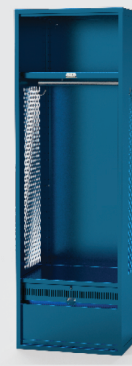
KD with Shelf & Footlocker