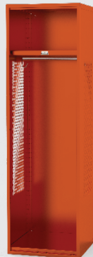
KD w/ Shelf

NOTE: Only an option on models equipped with a Security Box