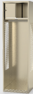
KD with Shelf & Security Box