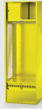
KD with Shelf, Security Box & Footlocker