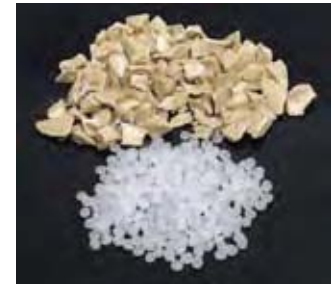
High density polyethylene starts as polymer resin (foreground). It is formed under high pressure to create dense, solid plastic sheets for manufacturing into locker components. Waste material from the process is immediately recycled (background) to make new sheets.

Where else but Penco would you look for a locker product that combines performance, value and good looks, with the backing of an industry leader?