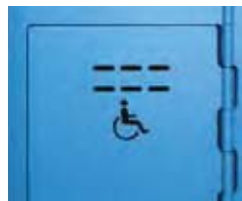
With ADA logo