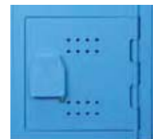
Round hole ventilation

FOR SAFETY PURPOSES, ALL LOCKERS MUST BE FLOOR AND/OR WALL ANCHORED