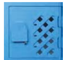
Mesh Door ventilation