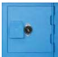
No ventilation (with built-in combination lock)