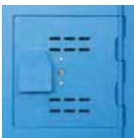
Standard ventilation (with built-in key lock)