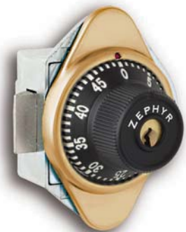
Model # 1954BE