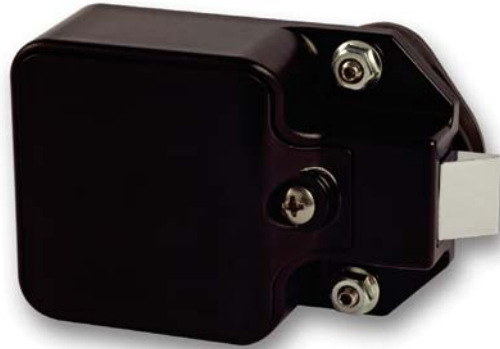
#'s 2154 & 2254 (rear view)