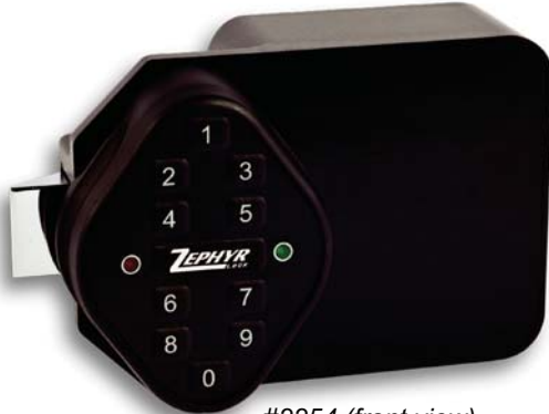
#2254 (front view)